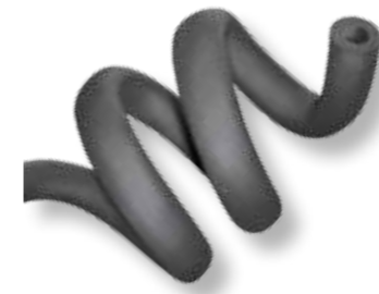
K-FLEX ST TUBES

K-FLEX ST products meet all the requirements demanded by civil and industrial refrigeration, air conditioning, plumbing, insulation of tanks, fittings, water pipes and all other applications that need thermal insulation.